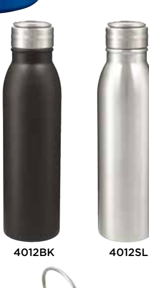
4012 Vida Sports Bottle

Single-wall construction and a stainless steel screw-on lid with durable metal handling loop. 710ml Capacity. Material - Stainless Steel.