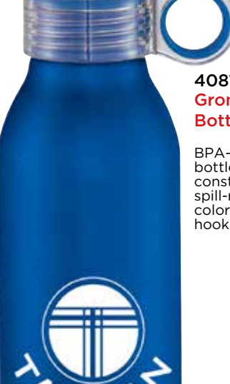
4081BL Grom Aluminum Sports Bottle

BPA-free Aluminum sports bottle features single wall construction with a screw-on spill-resistant clear lid with color pop feature on the hook. 650ml Capacity.